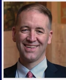
Secretary of State Tobias Read