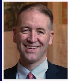
Secretary of State Tobias Read