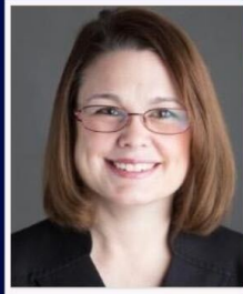
Senator Sara Gelsner Blouin